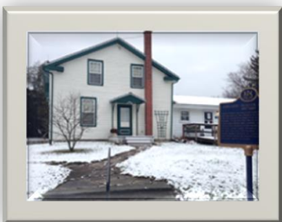
The Adelaide Hunter Hoodless Homestead in Winter