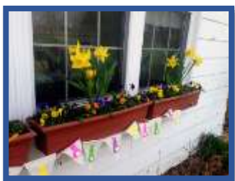
The Homestead on Easter Weekend 2017

We hope you enjoy all the pleasures that spring, the warmth and the bright shining sun brings!