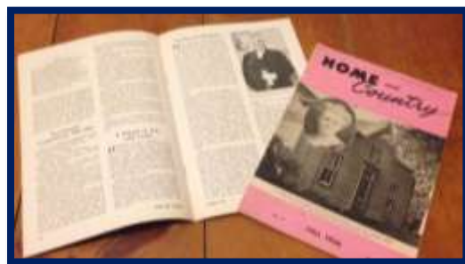
Home and Country magazines from 1957 and 1962. These artifacts are part of building the 'Preserving our HERitage' exhibit at the Homestead.