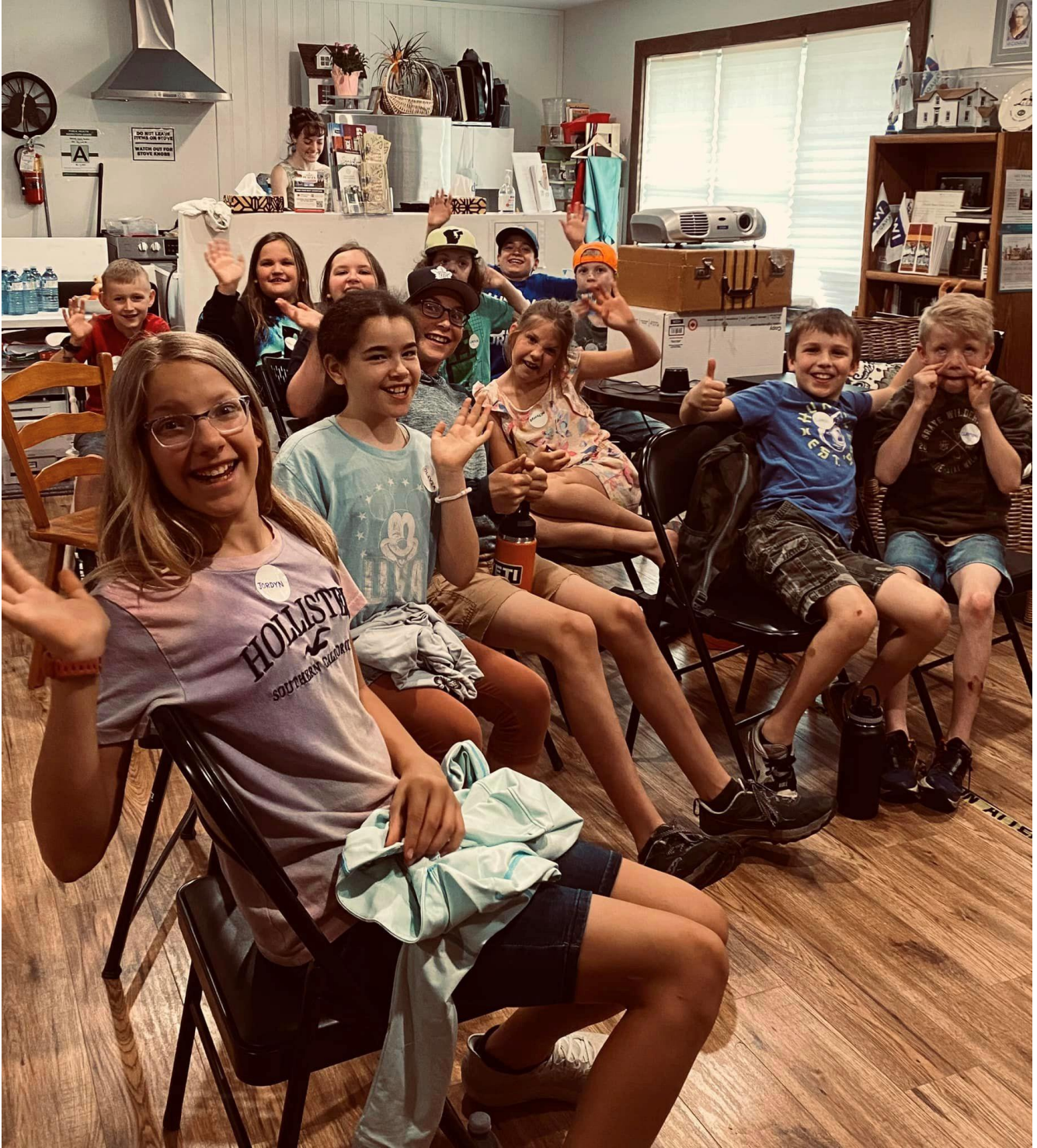
Homeschool at the Homestead. A fun day of wildlife photographic journeys, honeybees and pioneer fun! Thanks homeschool kids - you made our day!