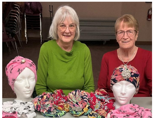
Caps made by members of the Hr. Grace NL. Branch of W I.

Virtual AGM information and Zoom link on pages 16