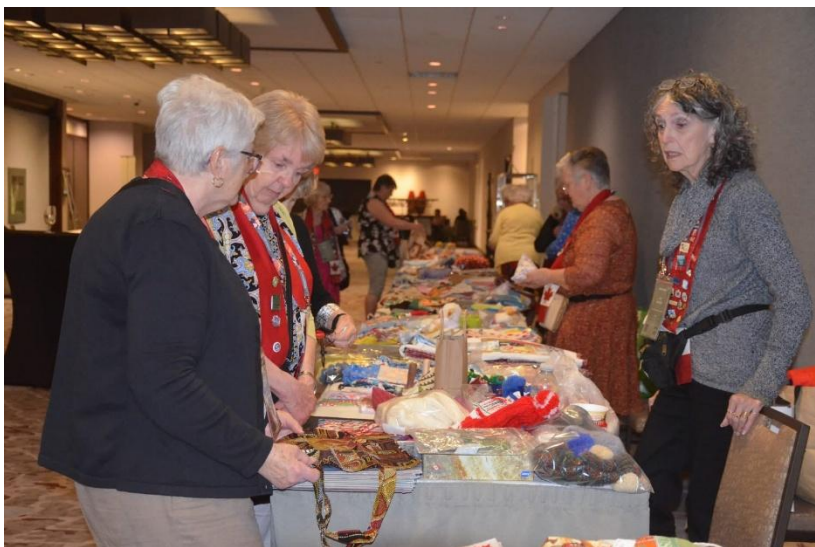
Sales Tables at ACWW Conference-Ottawa