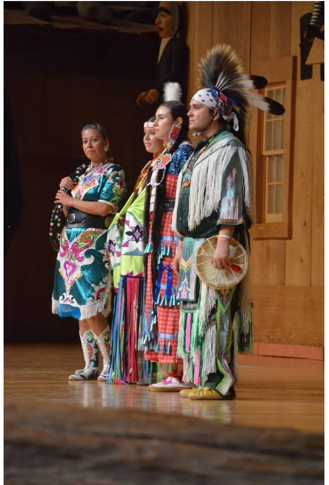
Indigenous peoples at Museum Gala Dinner

A strong emphasis was also placed on service and outreach. Conference participants generously contributed items for local women's shelters and food banks, demonstrating ACWW's commitment to supporting those in need and strengthening communities through collective action. These images serve as a reminder that the conference was not only a gathering for discussion and learning but also an opportunity to make a meaningful, positive impact on the host community.