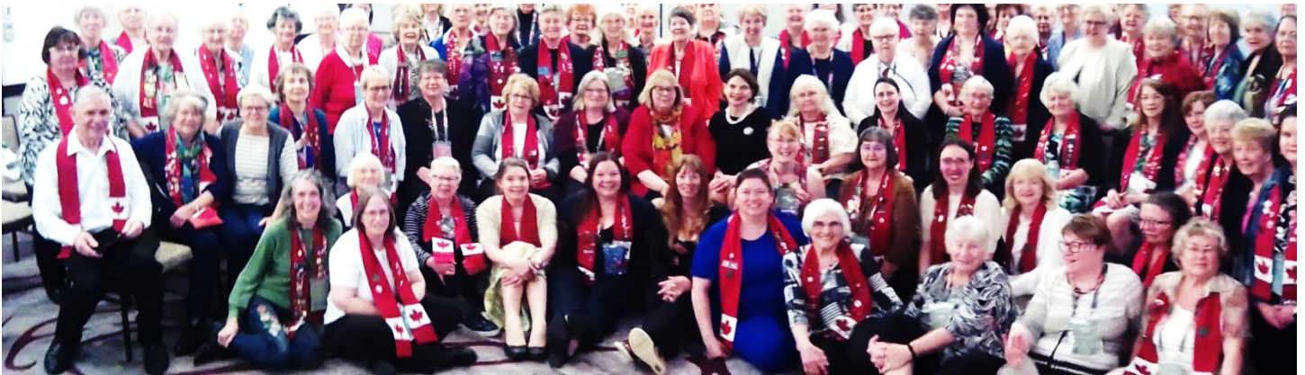
Group Photo of Canadian Attendees to ACWW Ottawa Conference-April 2026