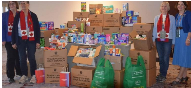
Donations from around the world for Food Bank and Women's Chelter - Ottawa