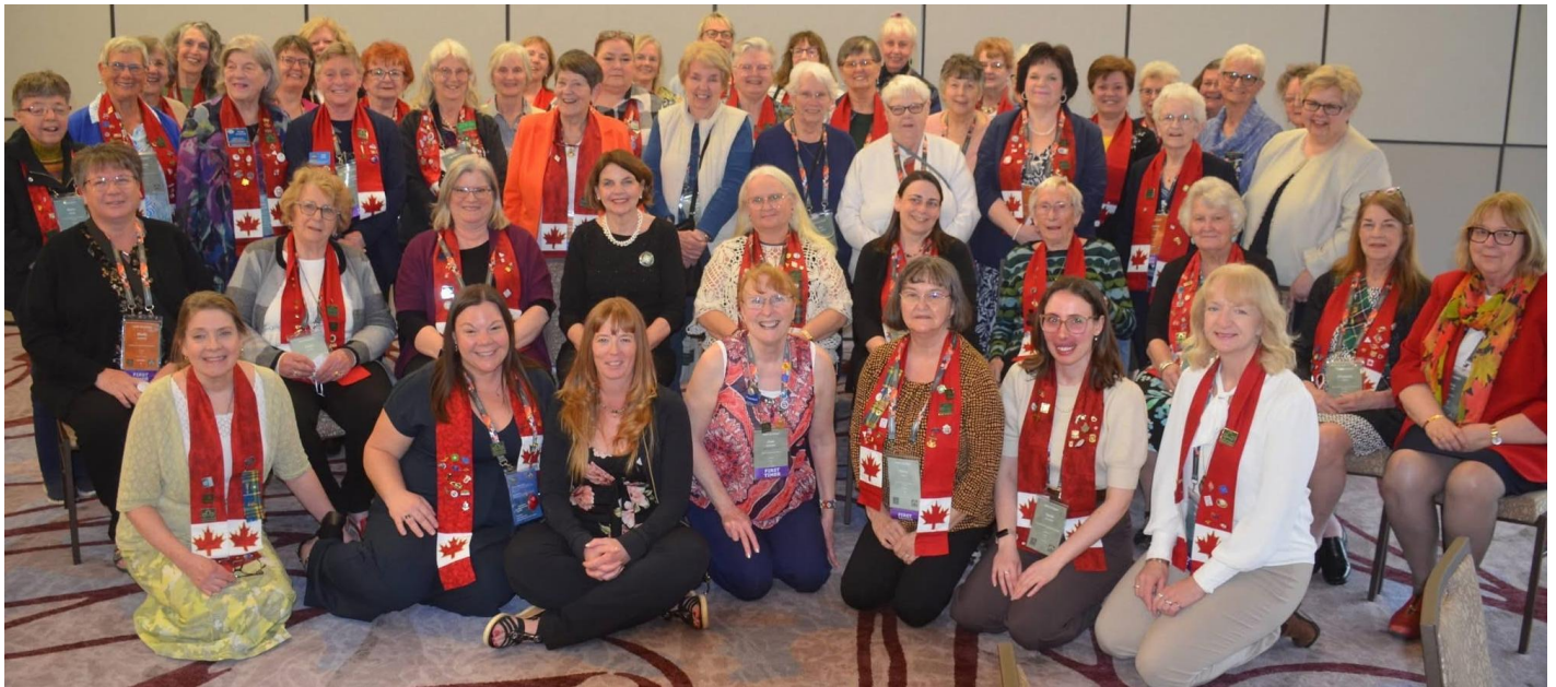
First Time Attendees ACWW Ottawa